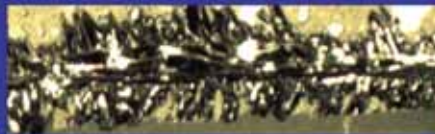
Ribbon Fracture Surface With EFD® Solder Paste