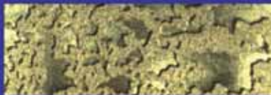
Ribbon Fracture Surface No Solder Paste