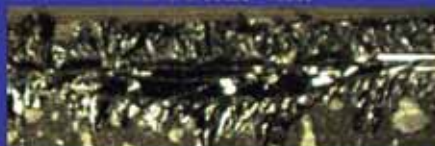
Cell Fracture Surface With EFD® Solder Paste

The addition of solder paste results in a higher pull force with minimal voiding. The higher strength solder joint moves the fracture to the silver-silicon interface.